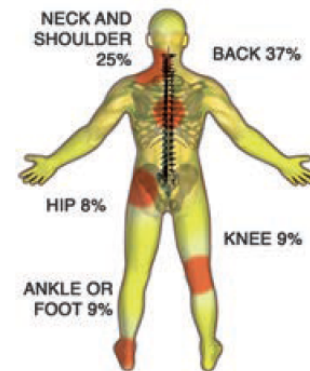
Figure 1: Musculoskeletal injuries among Irish farmers

To get a better understanding of the lived experience of back pain/injury among Irish farmers, detailed interviews were conducted with a number of farmers. Interviews explored how the farmer suffered the first time, the type of work that they regularly carry out on the farm, the changes made on the farm due to their back and how they manage their pain on a daily basis.